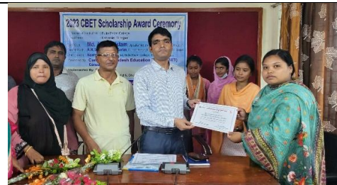
Bualia Bazar College- Dinajpur