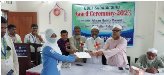
Adarsha High School and College- Tangail