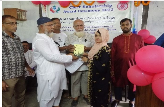
Kotchandpur Powra College- Jhenaidha