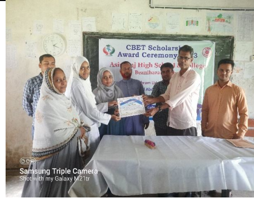
Asirgonj High School and College- Sylhet