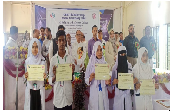
Al Helal Adarsha Degree College- Satkhira