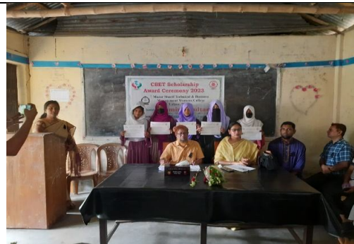
Mazra Sharif Technical & Business Management College- Natore