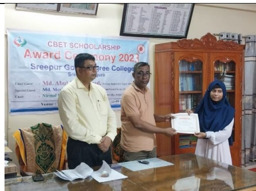
Sreepur Degree College- Bogura