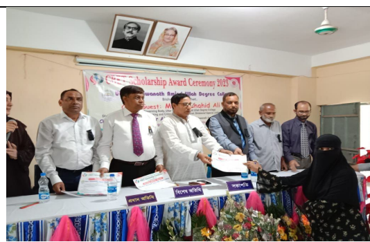
Uttor Biswath Amjad Ullah Degree college- Sylhet