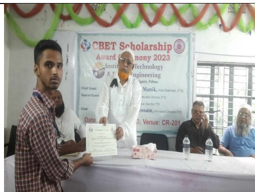
Institute of technology & Textile Engineering- Pabna