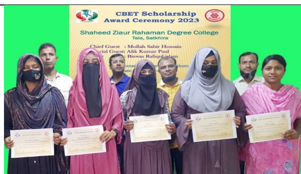
Shaheed Ziaur Rahman Degree college- Satkhira