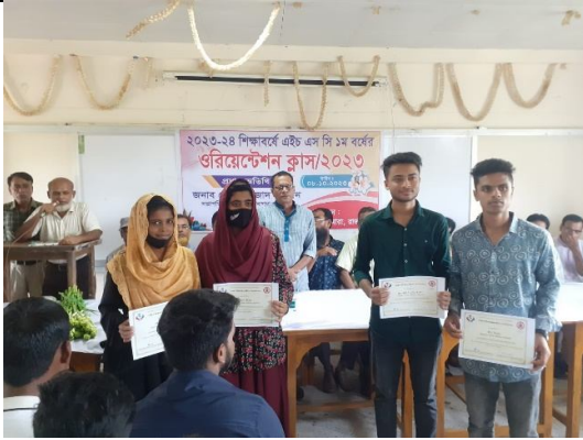
Bagmra College - Rajshahi