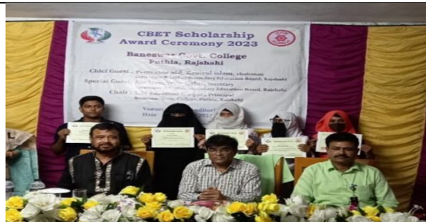
Baneswar degree College- Rajshahi