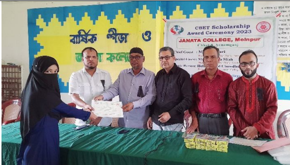
Janata College- Sunamgonj